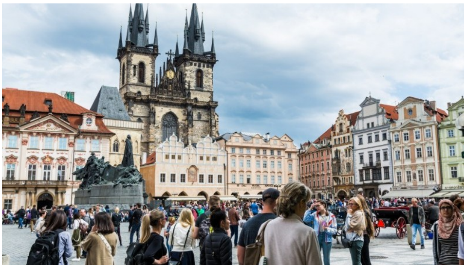
People in Prague

As the second wave of the pandemic surges, confidence in the Czech economy fell in October, mainly for services and consumers. But we think the figure is understated as the data isn't reflective of the latest partial lockdowns announced last week